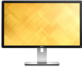
Dell 24 Ultra HD 4K Monitor | P2415Q