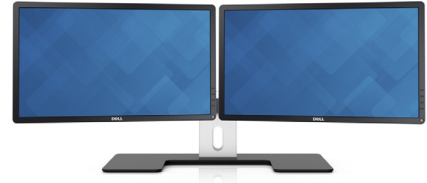
Dell Dual Monitor Stand